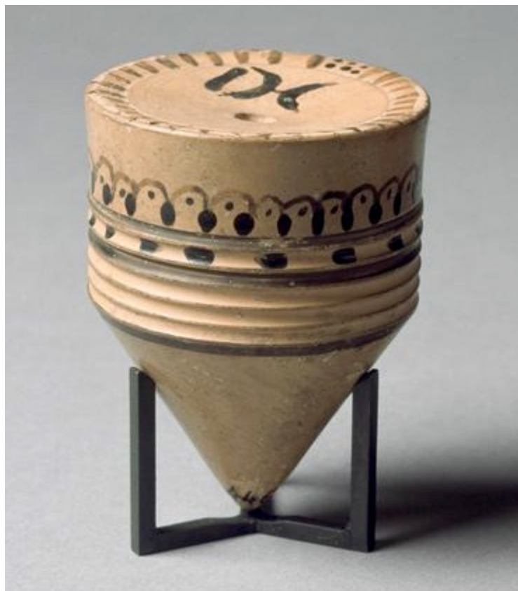
Toupie, Paris, Musée du Louvre CA 446. Époque classique. De Thèbes, sanctuaire du Cabirion

University of Fribourg, 13 march 2019 Maison Kairos, Rue Guillaume-Techtermann 8a